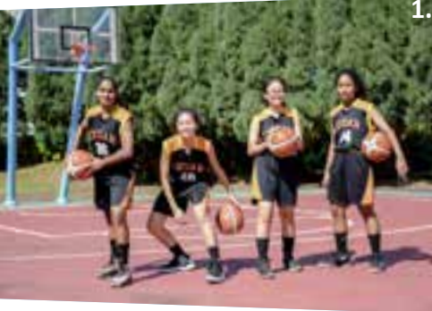
1. Basketball 2. Netball 3. Badminton 4. Track & Field 5. Football 6. Volleyball 7. Table Tennis