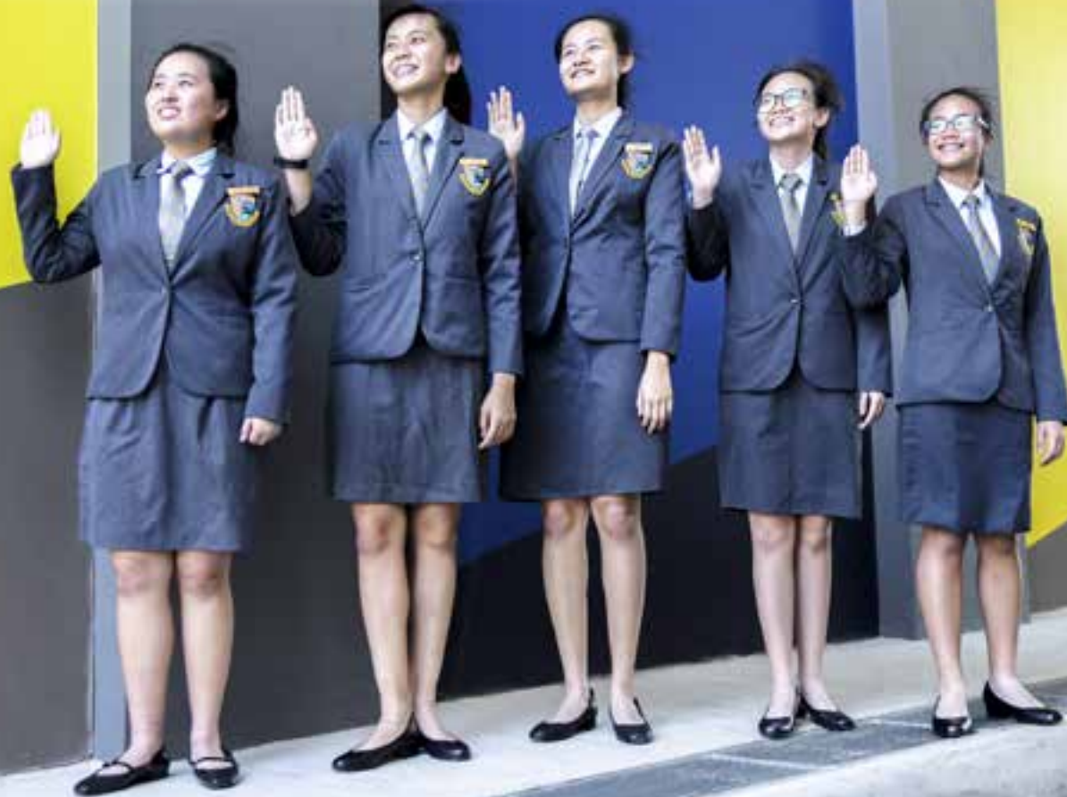
Leaders of Character

abused animals, helping out at elderly homes or giving tuition and teaching kids about life values. These programmes challenge students to initiate their own projects that involve volunteering with an organisation of their choice, identifying a social issue and coming up with a sustainable and creative solution to solve the social issue identified.