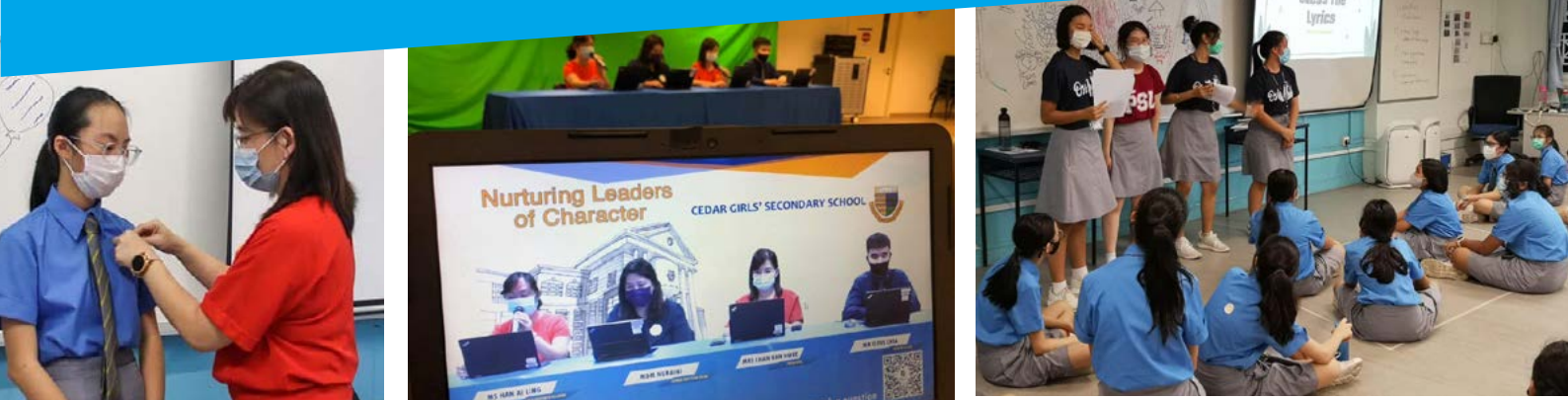
From left: Initiation Ceremony, Year 1 Parents Live Q & A Session and Year 1 Orientation Programme.