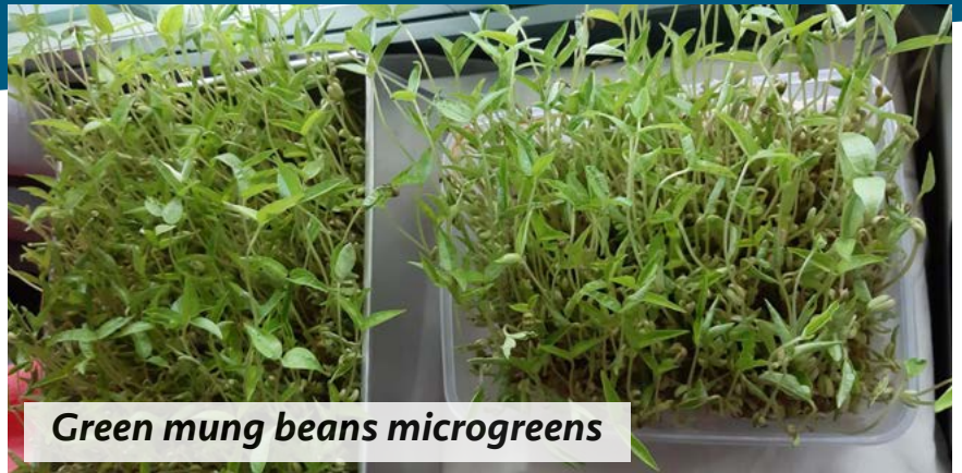
Green mung beans microgreens

You may use any plastic tray or disposable fruit boxes, layer a couple of kitchen tissues and place some soaked mung beans or sprinkle some mustard seeds.